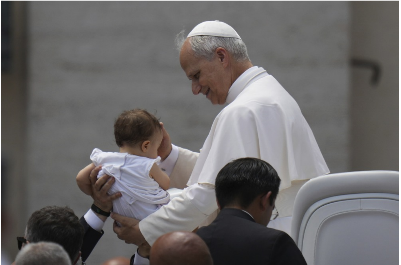
Pope Leo XIV leaves at the end of his weekly general audience in St. Peter's Square at the Vatican, Wednesday, June 18, 2025.