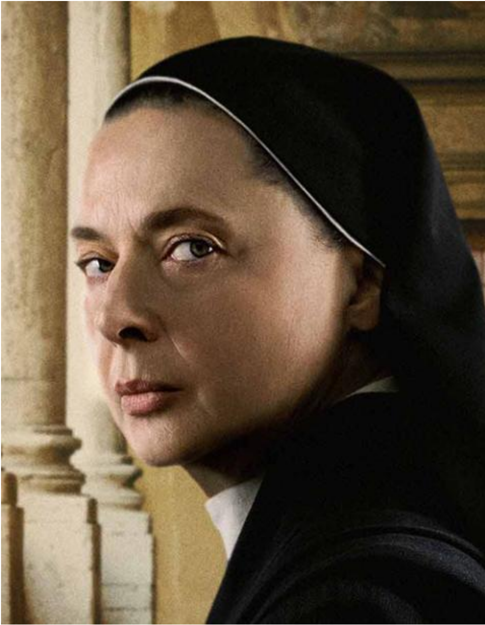
Isabella Rossellini in "Conclave" (Focus Features)

The 2024 film " Conclave " highlighted the vital but often thankless work of religious sisters. Ironically, the male characters in "Conclave" are gossipy, emotive and melodramatic, adorned in lace and finery. Meanwhile the character Sister Agnes, portrayed by Isabella Rossellini, is resolute and self-disciplined. Sister Agnes is hard to pigeonhole, neither old nor young, neither a font of divine wisdom nor a sheltered ingénue. Like the archetypal mother superior, she is intelligent and decisive, but her wisdom seems to derive, not from some supernatural line to God, but from her own experience and judgment.