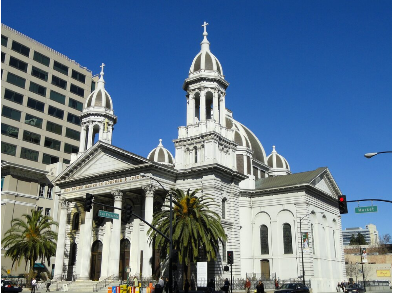
Cathedral Basilica of Saint Joseph in San Jose, California, is shown in a 2012 photo.