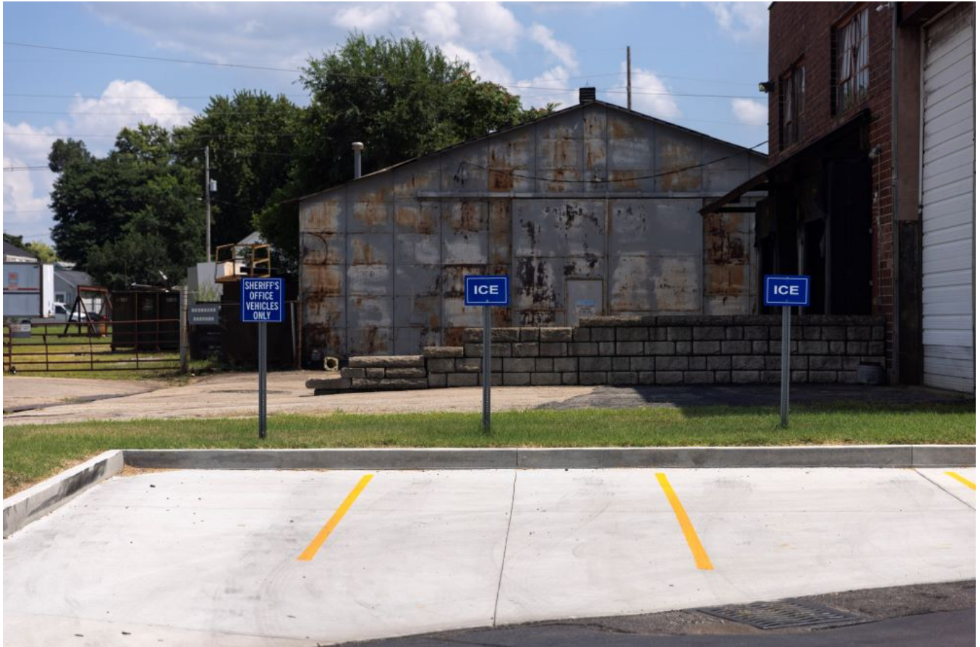
ICE parking spots outside the Butler County Jail