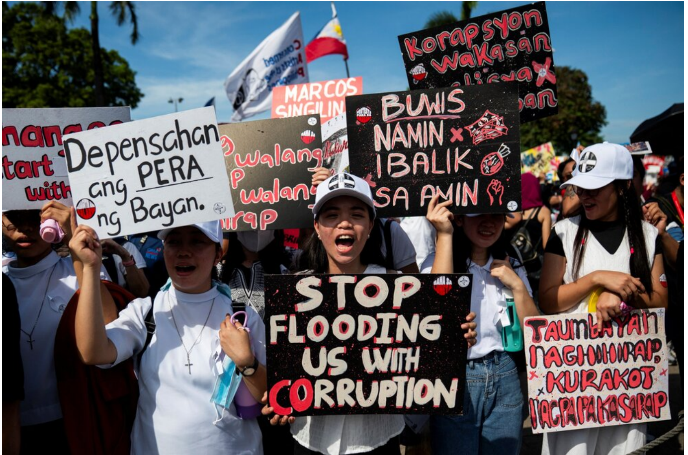
People hold placards during a protest in Rizal Park in Manila, Philippines, Sept. 21, 2025, denouncing what they call corruption linked to flood control projects.