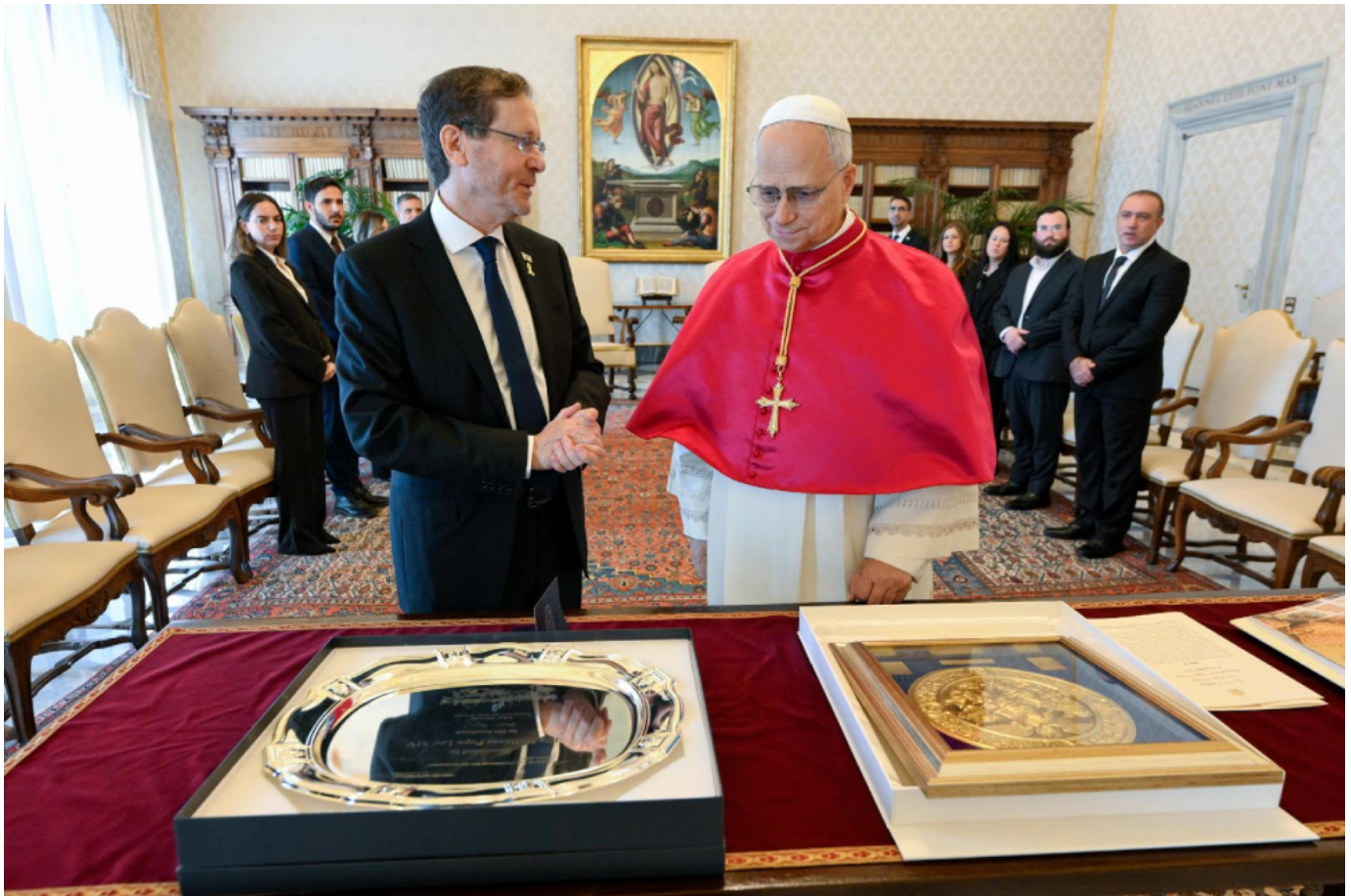
Pope Leo XIV and Israeli President Isaac Herzog exchange gifts at the end of their meeting in the library of the Apostolic Palace at the Vatican Sept. 4, 2025.

There is also one of the great challenges the church has faced in the post- Nostra Aetate era to still contend with: learning how to read and preach the Gospel in a way that does not contribute to anti-Judaism. There was great focus on this in the decades following Nostra Aetate and it must be revisited for this moment.