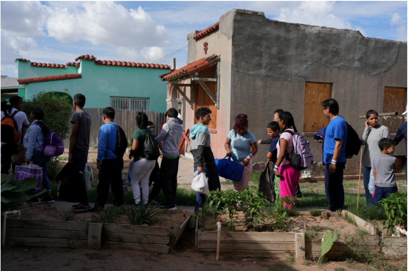
Venezuelan migrants at the Centro de los Trabajadores Agricolas Fronterizos (Border Farmworkers Center) in El Paso, Texas, wait in line to board a bus for Chicago and New York Sept. 2, 2022.

The family crossed the border into Texas in November 2024 aboard one of the buses organized by Texas Governor Greg Abbott to transport asylum seekers north. They arrived in Chicago with one suitcase between them and a scrap of paper with the dad's sister's address.