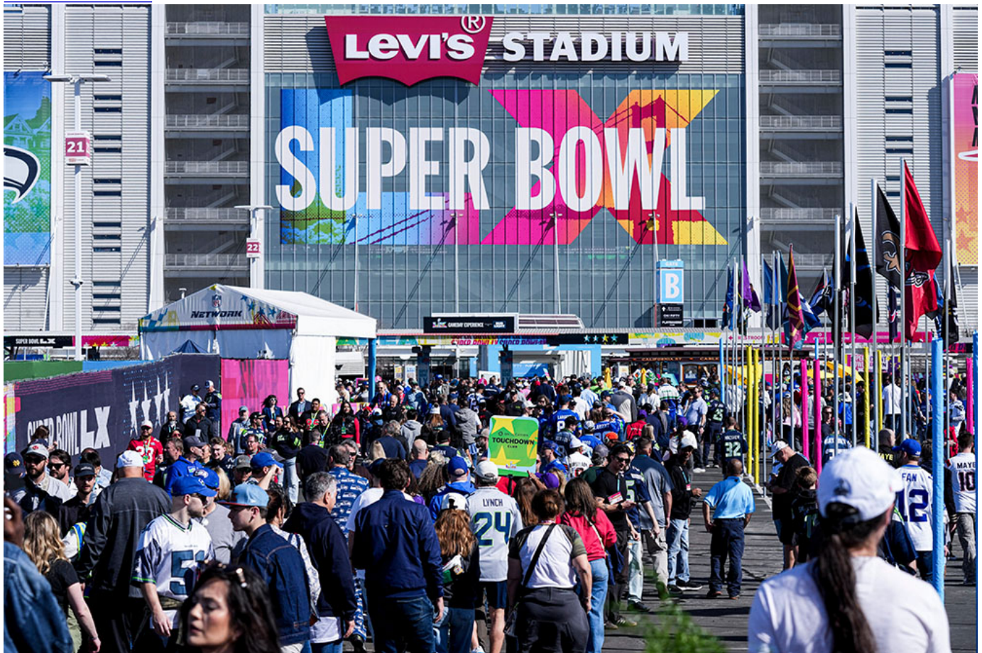
Fans arrive before the NFL Super Bowl 60 football game between the Seattle Seahawks and the New England Patriots Feb. 8, 2026, in Santa Clara, Calif.