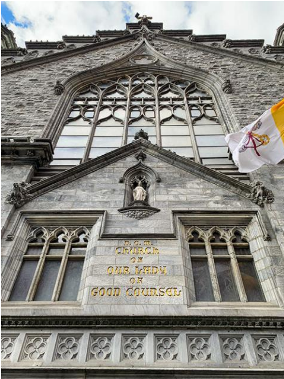
The façade of Our Lady of Good Counsel Church in Manhattan, N.Y.

Madigan described a worldview among some younger clergy that is highly rigid, contributing to what he sees as a widening cultural distance inside the presbyterate.