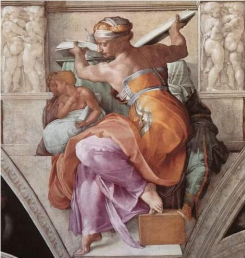
The finished fresco of the Lybian Sybil in the Sistine Chapel