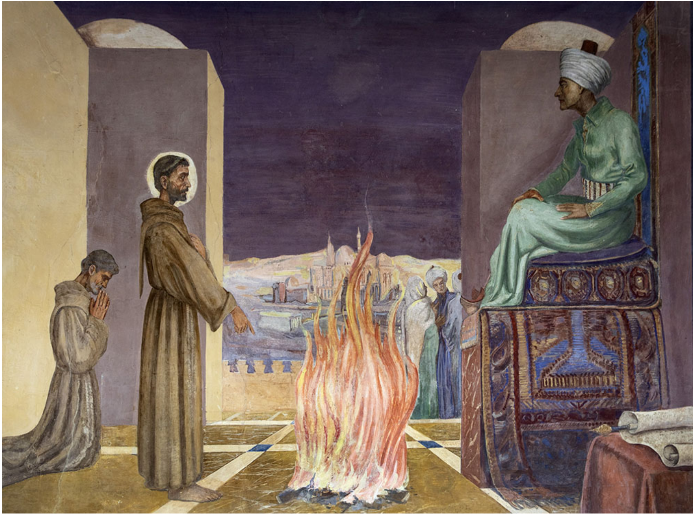
A fresco in the Shrine of La Verna in Italy depicts St. Francis of Assisi's meeting with the sultan of Egypt.