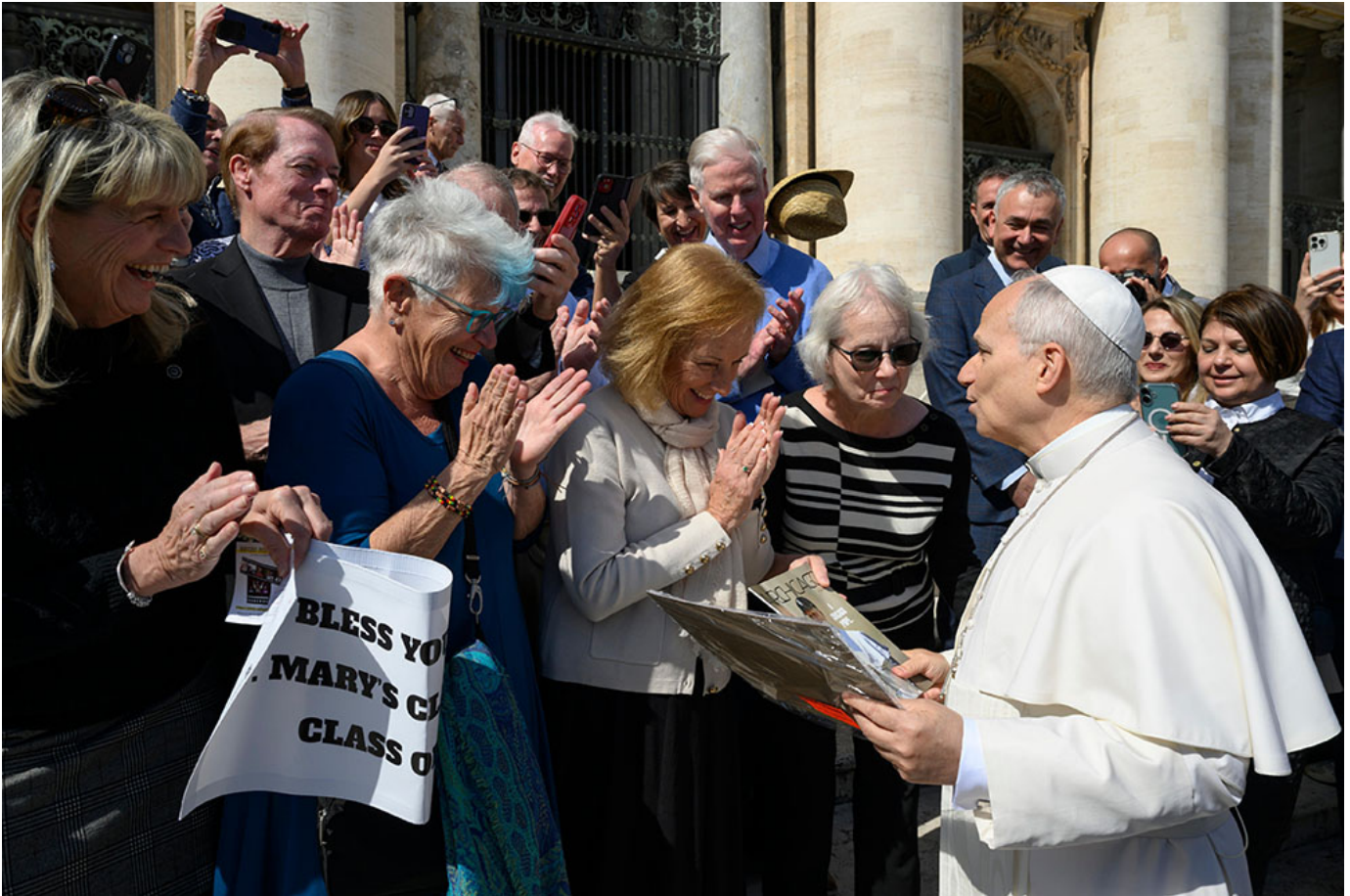
Pope Leo XIV meets with former classmates who graduated from the lower school of St. Mary of the Assumption in Chicago in 1969 after the general audience in St. Peter's Square at the Vatican March 18, 2026.