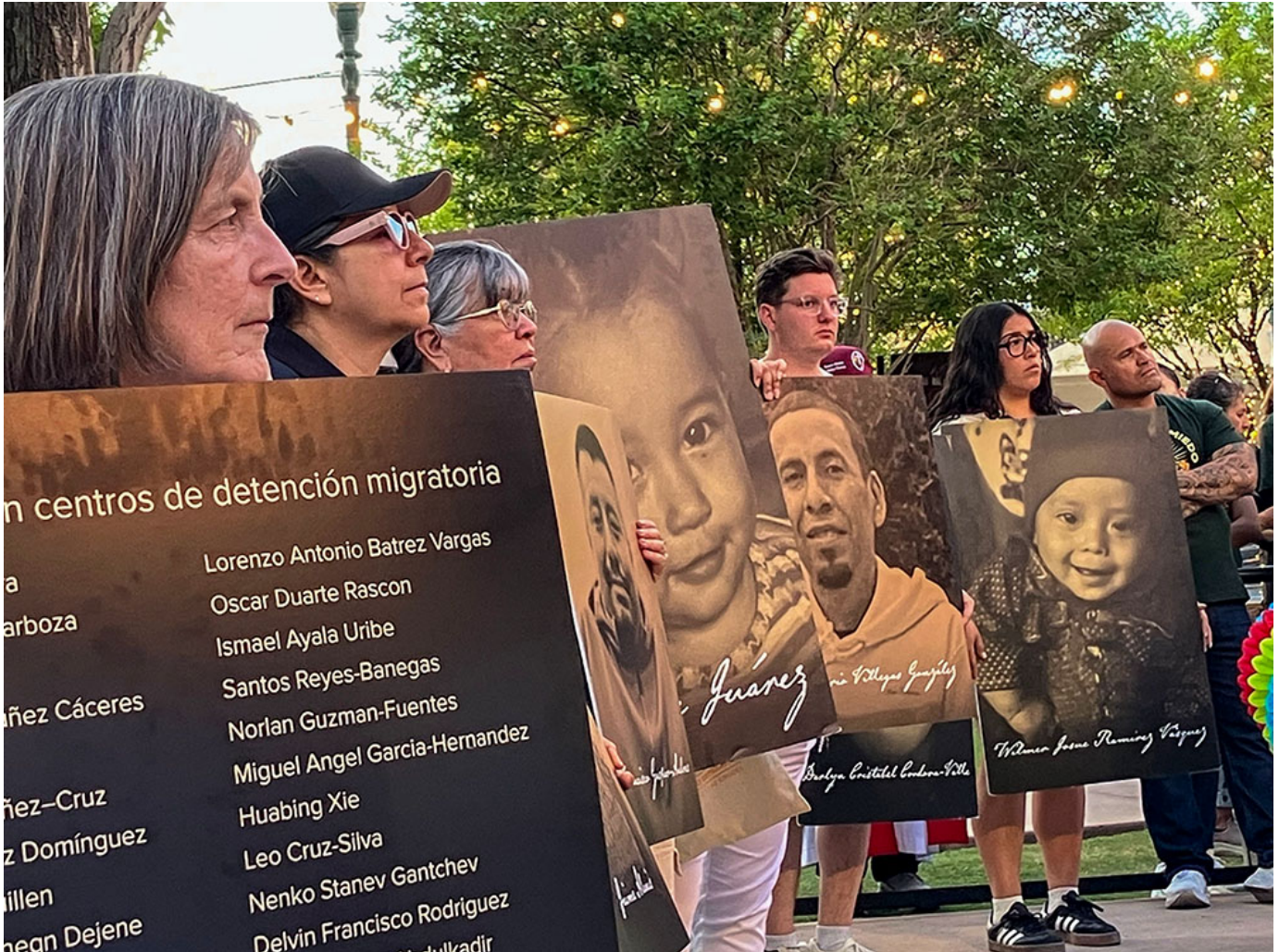
Demonstrators hold placards with photographs and names of people who died in immigration-related circumstances as they take part in a protest in El Paso, Texas, March 24, 2026, against mass deportations and the immigration policies of the Trump administration.