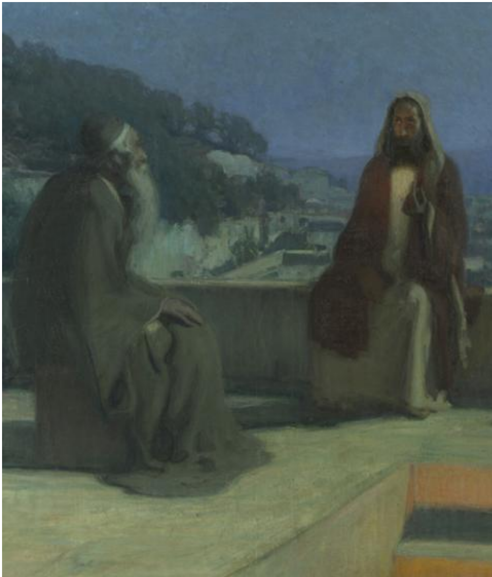
"Nicodemus," detail of an 1899 painting by Henry Ossawa Tanner (Pennsylvania Academy of the Fine Arts)

Just as Nicodemus found himself speaking with Jesus during the night, a moment of darkness, religious men and women, facing various types of nights or moments of darkness — including diminishing numbers of members in their congregations or the difficult social problems facing Latin America — religious life, too, must begin to speak with Jesus, she said.