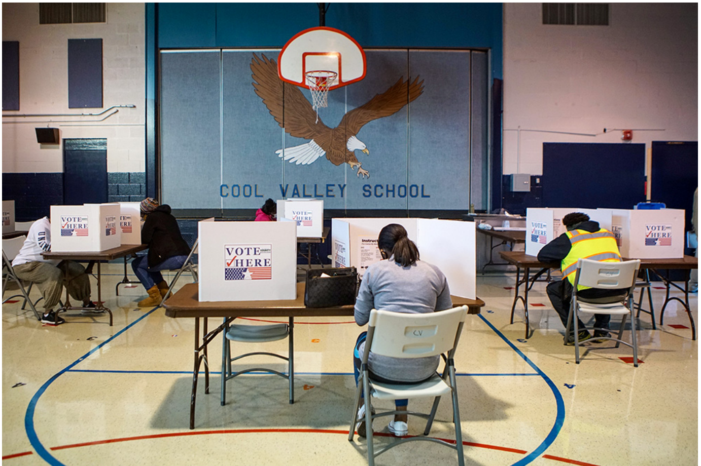
Voters mark their ballots at a Ferguson, Mo., polling station during Election Day Nov. 3, 2020.