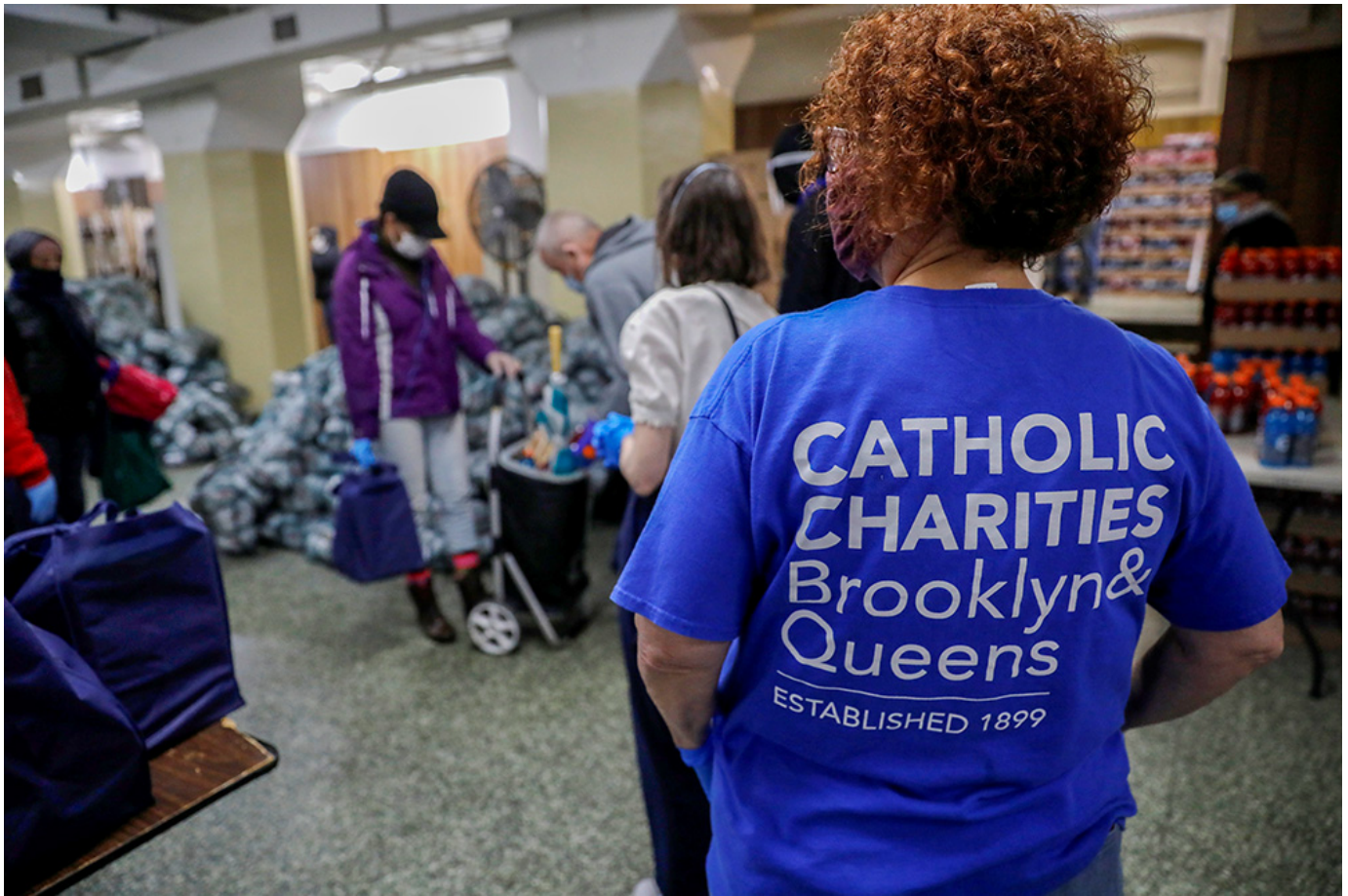
A volunteer in New York City looks on as people receive free food at a food pantry for needy residents run by Catholic Charities Brooklyn and Queens April 24, 2020.