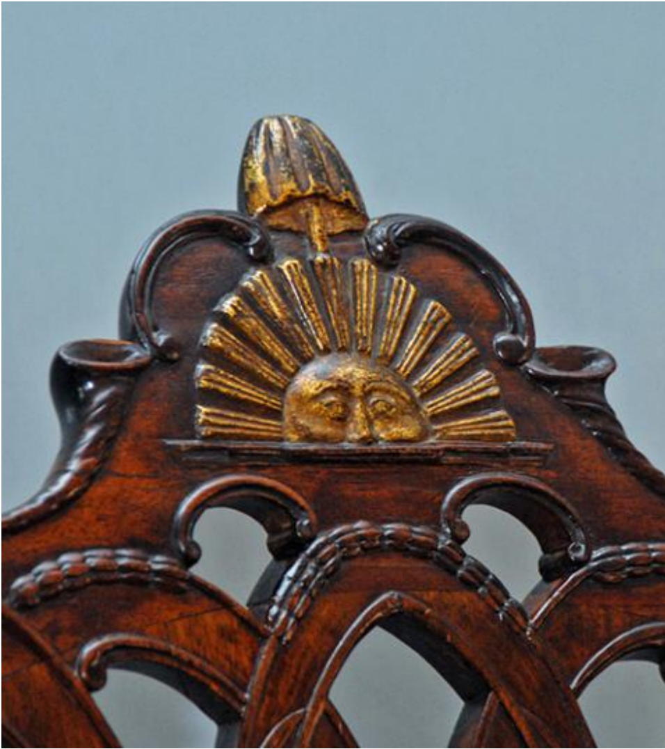
Detail of what became known as the Rising Sun Chair, used by George Washington when he presided over the 1787 Constitutional Convention

"In his Notes on the Constitutional Convention, James Madison relates that, in the closing moments of the convention, Benjamin Franklin confided he had worried for months whether the figure of the sun painted on Washington's chair was rising or setting. As the last few delegates rose to sign the Constitution, Franklin averred he now knew it to be a rising sun. But is it still? I remember the euphoria of 1976, celebrating the bicentennial with my new fiancée in Philadelphia. We knew then, with the clear eyes of youth, that was indeed a rising sun, full of promise. Now, darkened by the ugly nationalism and demagoguery of America's last decade, I worry. Does it still rise?"