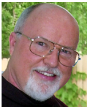
Fr. Richard Rohr