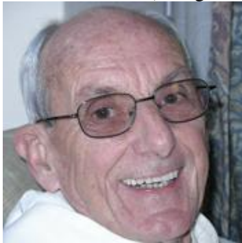
Fr. Albert Nolan