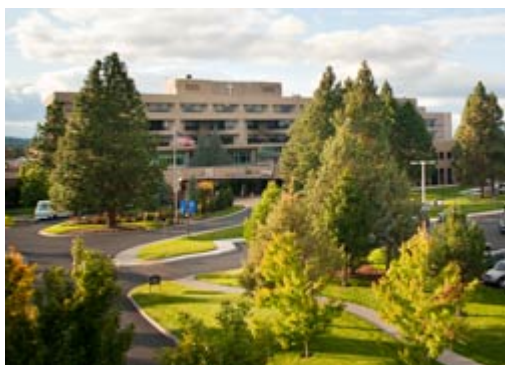
St. Charles Medical Center in Bend, Ore.

Declarations by two bishops that hospitals in their respective dioceses may no longer declare themselves 'Catholic' appear to have had little or no impact on the medical centers' patient census, health care delivery, income, spiritual outreach, or other elements of day-to-day operations.