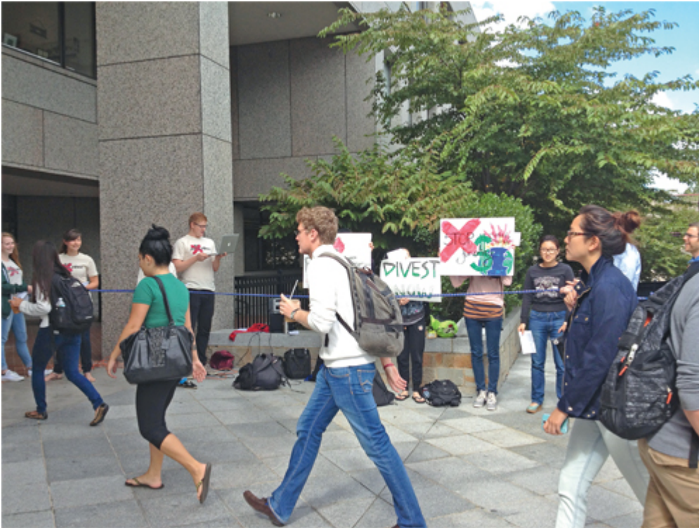
A call to divest from fossil